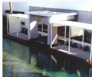
specific views through the kitchen and dining area that face the swimming pool (opposite page) this area is the focal point of the villa and leads over to the jacuzzi and hot tub on the opposite side (above) and still will enjoy around the garden (above right) pool table in the entertainment room

Gary Fell, the architect, has incorporated an abundance of room in the design for enjoying the outdoor/indoor experience; the experience that most modern visitors to Bali are seeking. The sunken lounge area and dining pavilion at the entrance provide the main covered living area beside the pool. The space is ideal for hanging out, dining, cooking and chatting with friends. Four cabanas, in a modern translation of the local Balinese; Balu style, are set on the opposite side of the pool with a central Jacuzzi providing the option of a plunge in the pool or a soak in the warm tub—more great choices for the discerning traveler. All around the garden area there are plushly-cushioned nooks and crannies for guests to take a rest or another sip on their daily Moët & Chandon